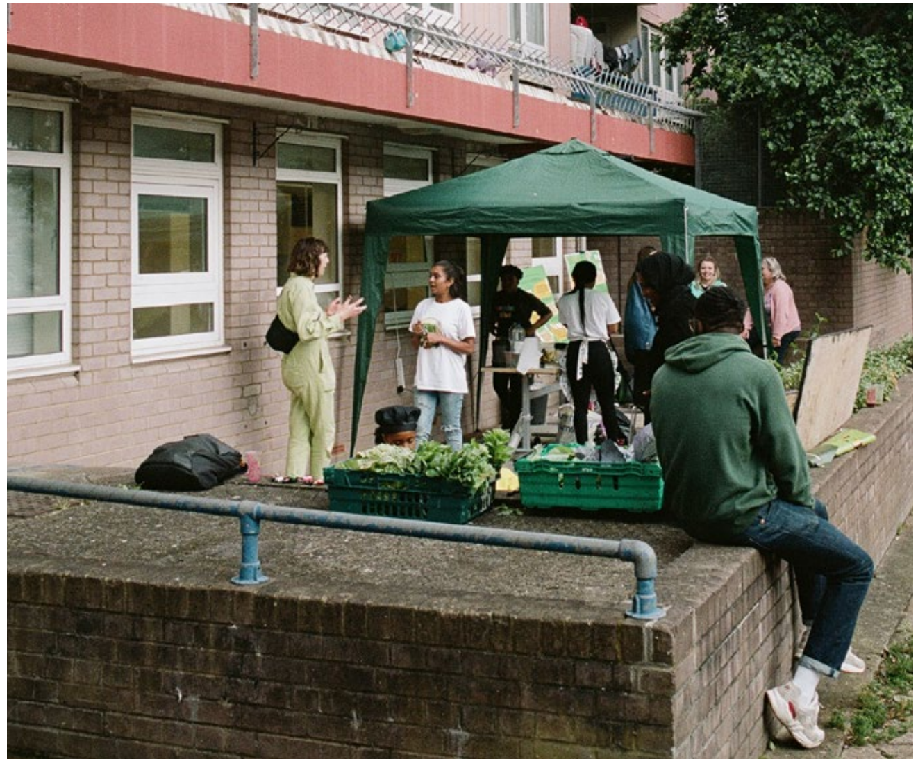
Visions for Northolt pop-up event, 2021

As set out in the Ealing Council Plan and Plan for Good Jobs, Northolt is a priority area of focus.